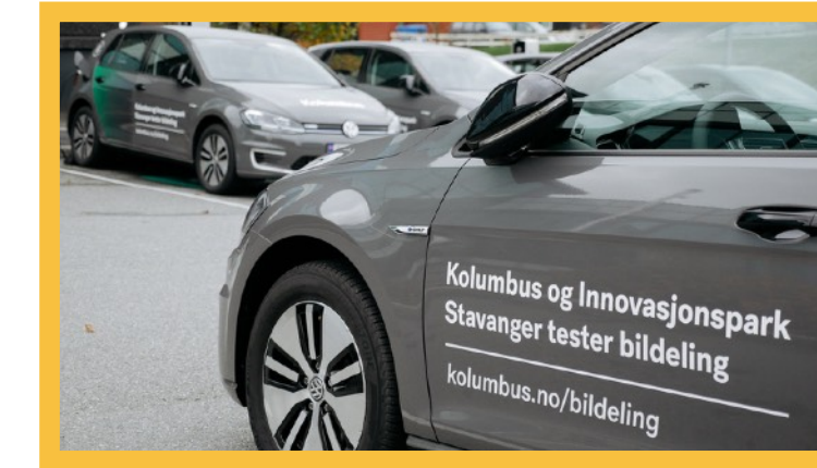
Car fleet/car pool